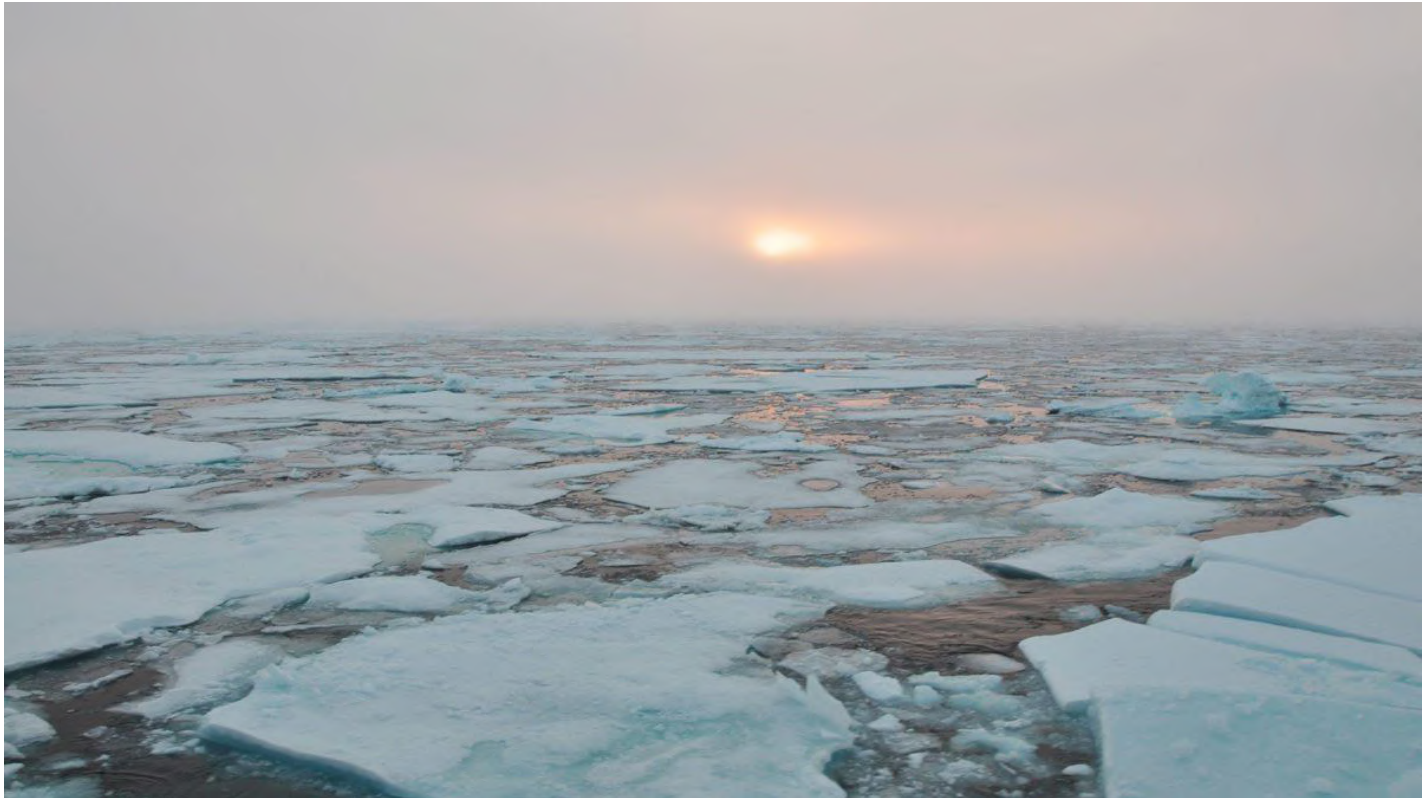
Sunrise at the ice horizon in the western Arctic Ocean

Woods Hole, Mass. — A new study provides the first observational evidence of the stabilization of the anti-cyclonic Beaufort Gyre, which is the dominant circulation of the Canada Basin and the largest freshwater reservoir in the Arctic Ocean.